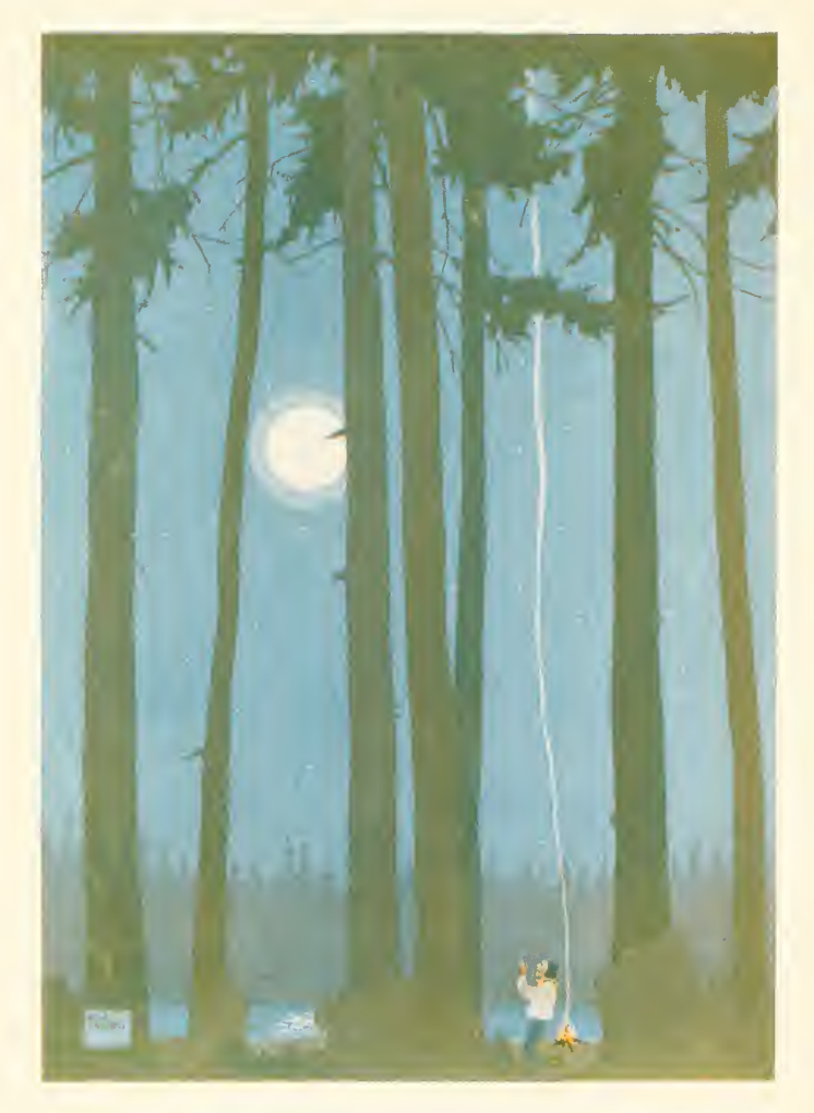
The Indian Guide's Evening Prayer (page 59)